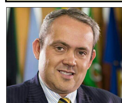
Moresby South MP Hon. Justin Tkatchenko