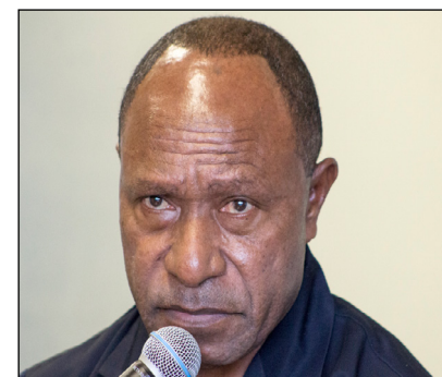
Morobe Governor - Hon. Ginson Saonu