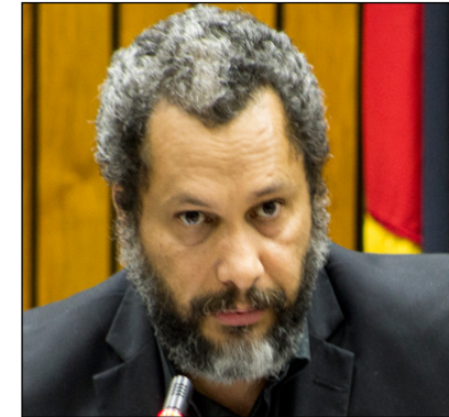
Oro Governor - Hon. Gary Juffa