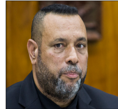
East Sepik Governor - Hon. Allan Bird