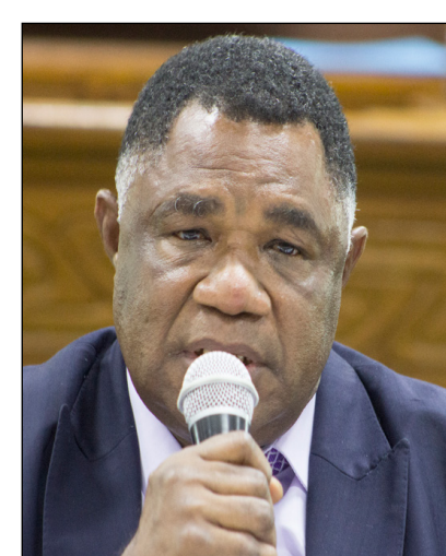
West New Britain Governor - Hon. Francis Maneke