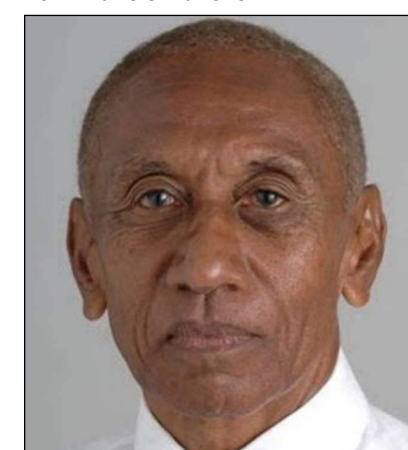
New Ireland Governor Rt Hon. Sir Julius Chan