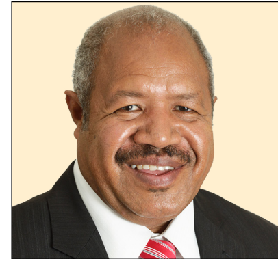
NCD Governor - Hon. Powes Parkop

www.ncdc.com.pg | www.amazingportmoresby.com