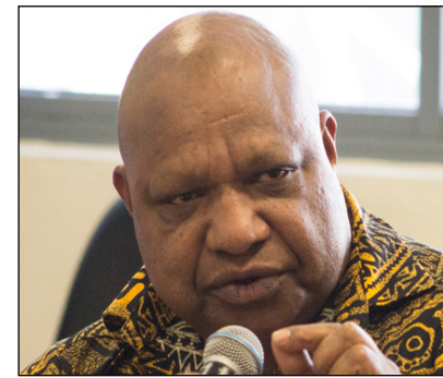
Southern Highlands Governor - Hon. William Powl