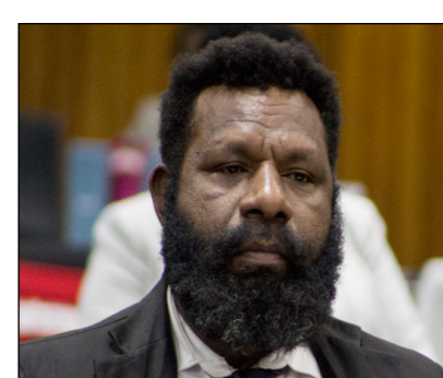
West Sepik Governor - Hon. Tony Wouwou