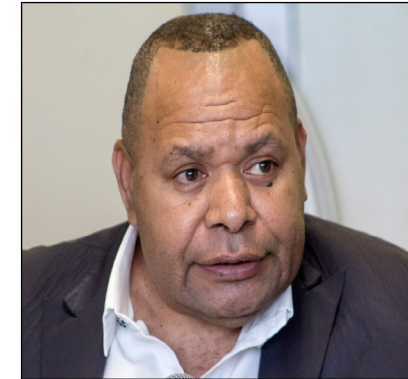
Hela Governor - Hon. Philip Undialu